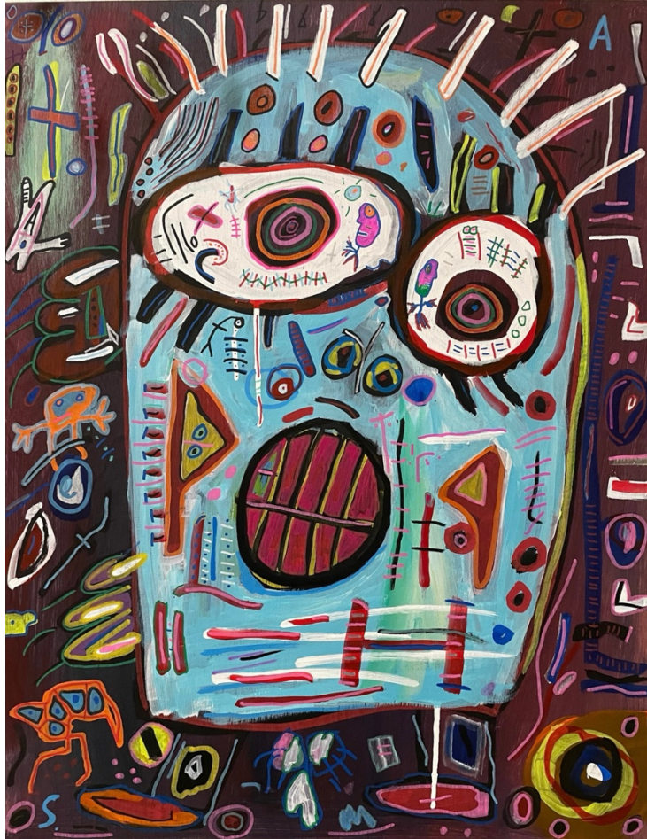
Joey Tepedino, Untitled , 2021, mixed media on canvas, 24" x 18"

His work’s simultaneous specificity and chaotic intentionality create macrocosms—vast and multifaceted systems that represent the true complexity of what is seemingly only a small fragment