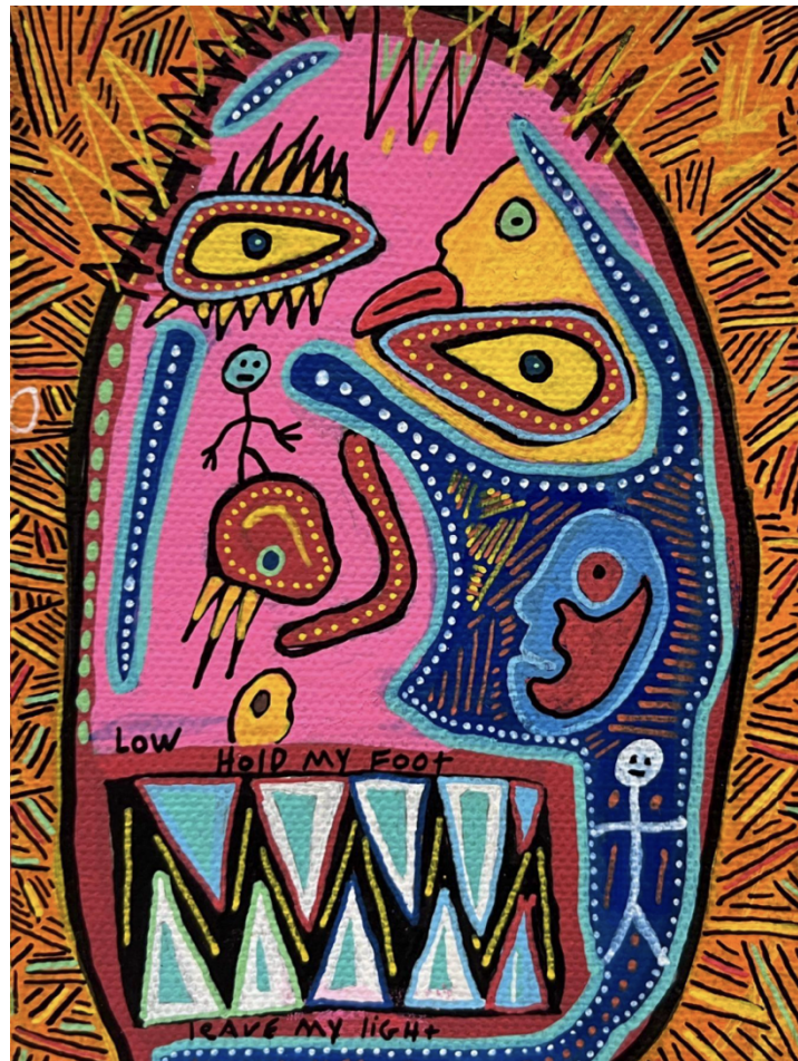
Joey Tepedino, Jeffy Smeth, 2023, mixed media on canvas, 6" x 4"

Opening reception with the artist Thursday, September 21 st , 6:00-8:00 pm.