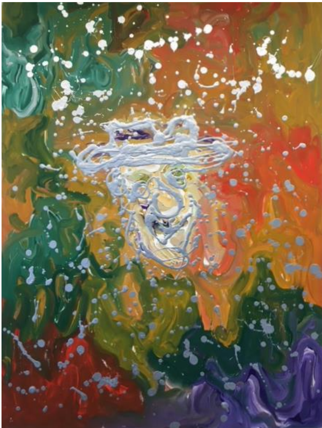
Bobby G, Boost , 2022, Acrylic on canvas, 48'' x 36''