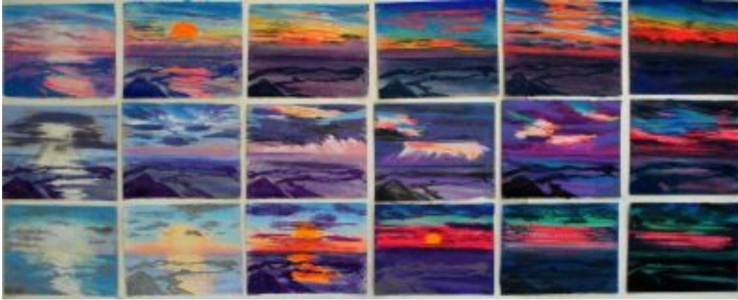
Three complete Pic Paradis Pastel Sunset Series, 2020 Pastel on Bugra Hahnenmühle paper, Each work comprised of six sequential 9" x 12" images, 9" x 82" overall

These works ultimately humble us to the sublime nature of our earth, while reminding us of our irrelevance in the larger universe. In this sense, they invite us to revel in our own fortuitous existence captured in every beautiful landscape and sunset. Brechneff's new pastels offer a similar experience, but perhaps with a refined edge that only years of familiarity with a place, and a pandemic, can bring.