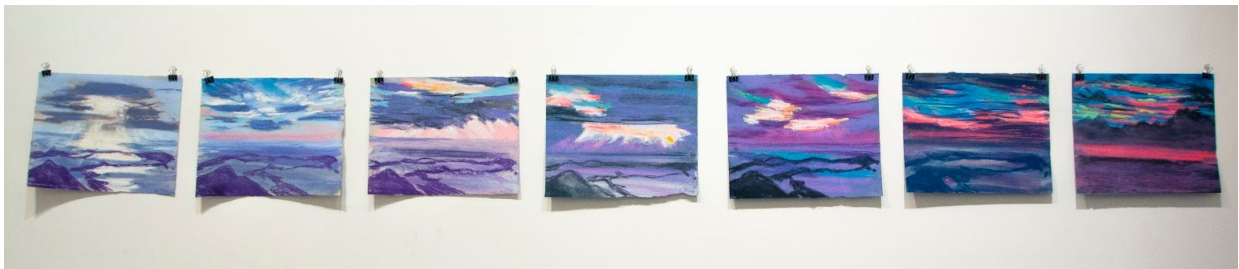
Pic Paradis Pastel Sunset Series 11, 2020